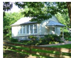
West Bay Common School Children's Museum