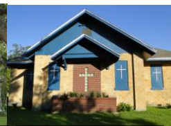
The Friends Church