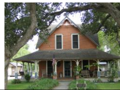
The Cox-McQuirk Home