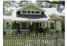
The Snell- Kilgore Home