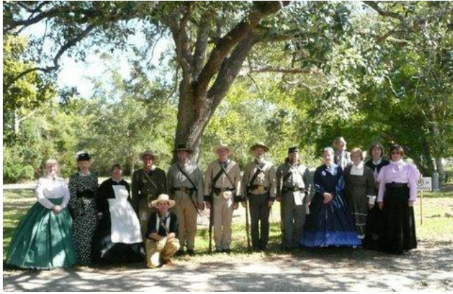
The cast of Ghosts of the Past and Texas Infantry Thank You All for A Great Job!