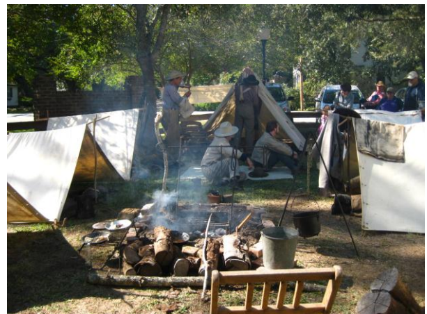
Visitors enjoyed watching the Texas Infantry in action as they encamped on our school grounds.

Information needed for the volunteers who are working at the museum for the Historic Homes Tour will be ready on the same day as the decorating. I will be there to answer any questions or concerns about that upcoming event. If you cannot be there that morning, I will contact you by phone. Thank you in advance for your support in the work of the museum.