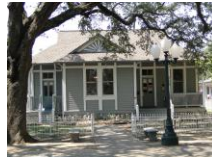
The Station Master's House