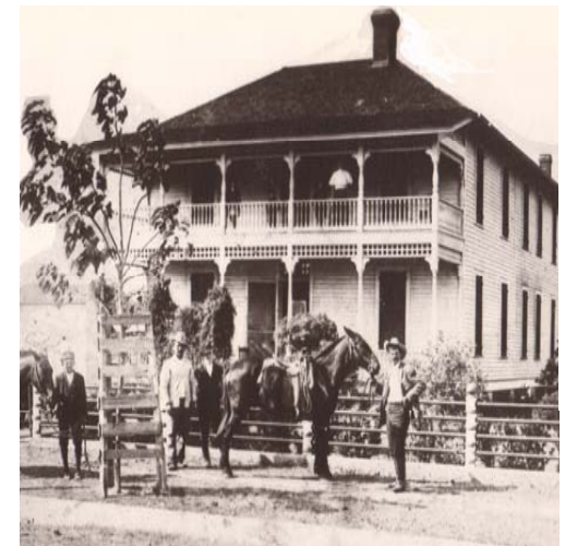
The T. J. Dick Home - Built in 1904

An illustrated walking or driving tour to view historic homes & century old oaks.